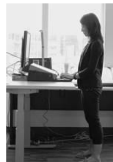
Upper & lower back bending forward.